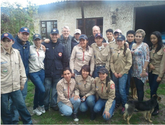
Royal Rangers from the Tunja area.